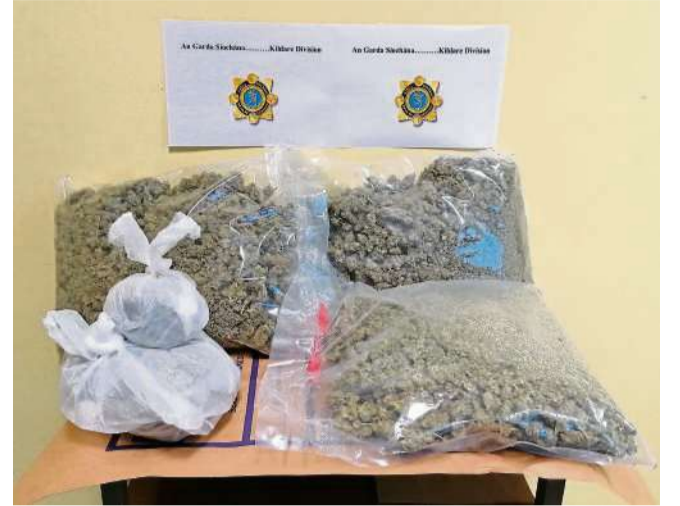
The drugs seized in Kilmeague

The man in his 20s, arrested in relation to this incident was charged with drugs-related offences and appeared before the Criminal Courts of Justice on Monday