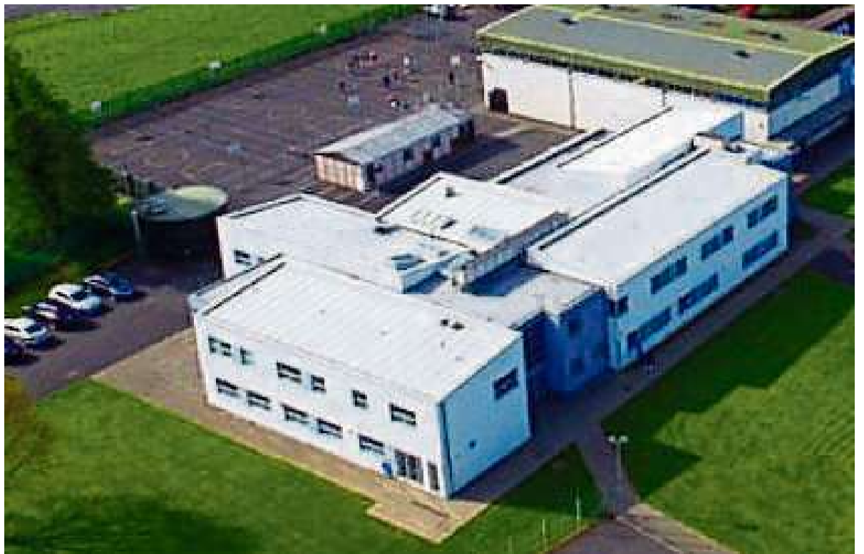
Scoil Dara in Kilcock