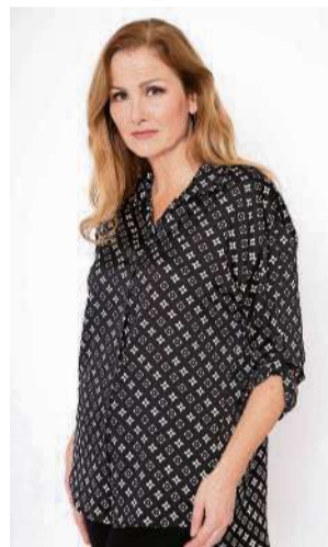
Star print satin blouse €59 and black trousers €49