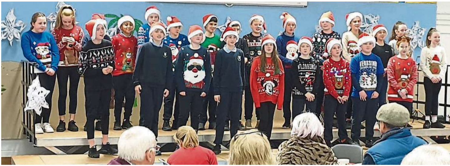
The sixth class in song!