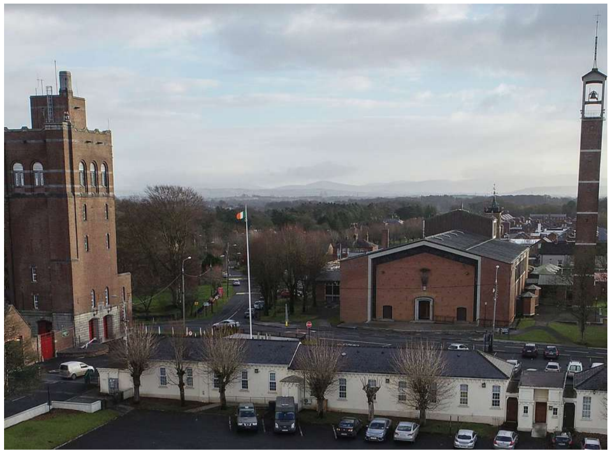
The Defence Forces Training Centre at the Curragh Camp where a €2m investment has been confirmed

Deputy O'Loughlin said, "The Curragh Camp is the heart of the Defence Forces, and so funding must be invested into it. I visited the barracks with the committee for Foreign Affairs and Defence following my invitation from the committee to view the conditions. I've seen first-hand the conditions serving men and women are working and staying in — and they