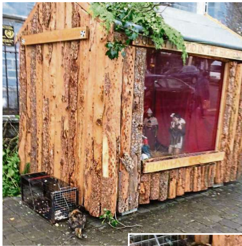
Little Beth, right, was found living under the Christmas Crib (left) on Main St, Newbridge

KWWSPCA HELPLINE - 087 127 9835 KWWSPCA COMMUNITY CAT CARE GROUP - 087 251 7381 EMAIL: - KWWSPCA@GMAIL.COM WEBSITE: - WWW.KWWSPCA.IE