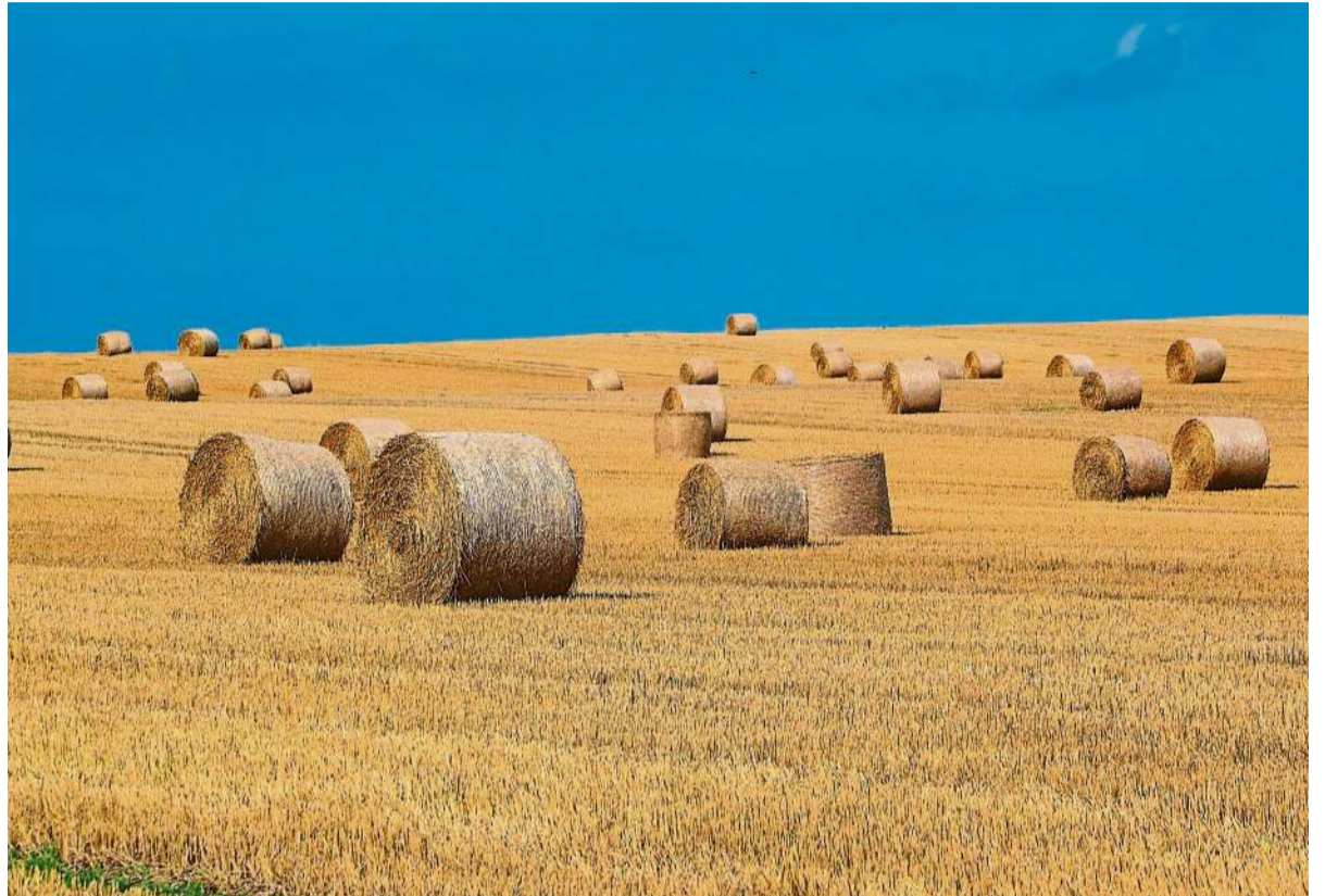
There were 19 recipients of the Farm Assist Scheme in the Lilywhite county

It added that approximately 30% of the current 5,966 recipients on the Farm Assist scheme are aged 60 years or older and 370 are aged less than 35 years.