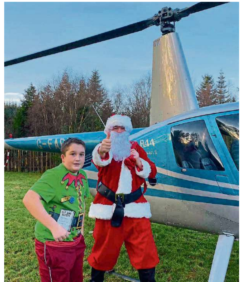
Santa and Elf making their visits to Tiglin centres in Co Wicklow