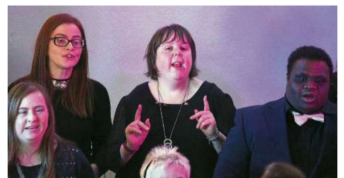
Music in Motion KARE Choir members