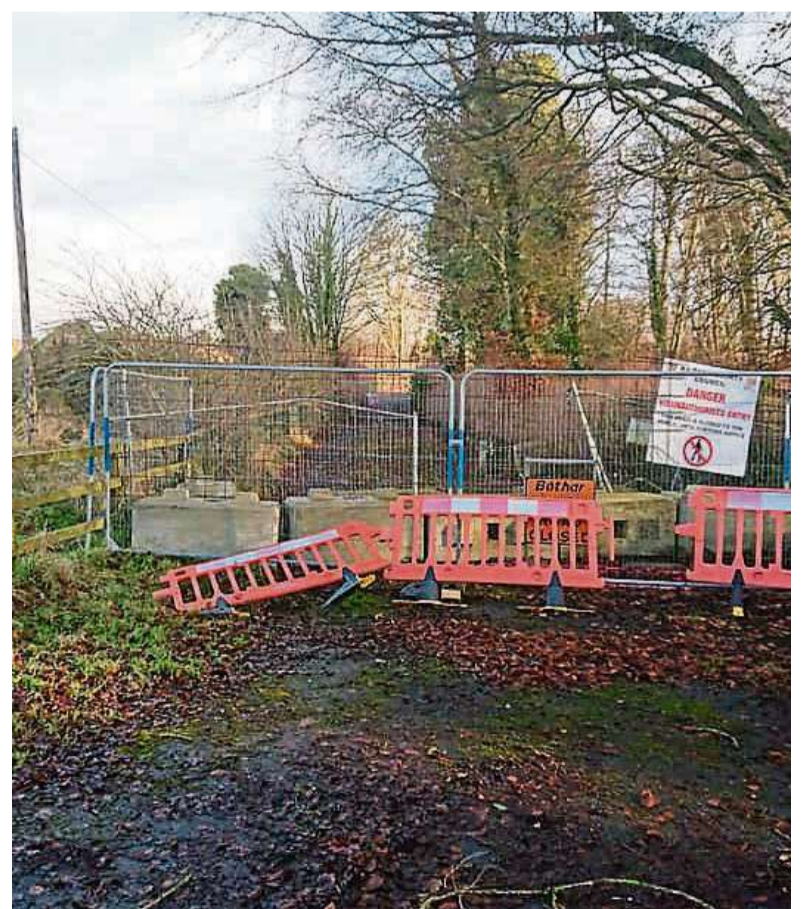
The L6042 was shut by the Council in August 2016 after a section of it became unstable due to subsidence.

Notwithstanding the above, the 2019 regional and local road grant allocations will be announced in the New Year. It will then be open to Kildare County Council to fund works along the L6042 Coughlanstown Road from that grant allocation if it so wishes."