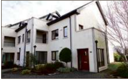
THE PENINSULA, ALEXANDRA WALK, CLANE