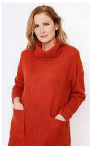
Cowl-style knit €59 and black trousers €49

Golden Spiderweb is an Irish brand, owned and run by the Robinson family. You can buy online 24/7 or call into their Newbridge store at Whitewater Shopping Centre, or stores nationwide or online at www.goldenspiderweb.ie