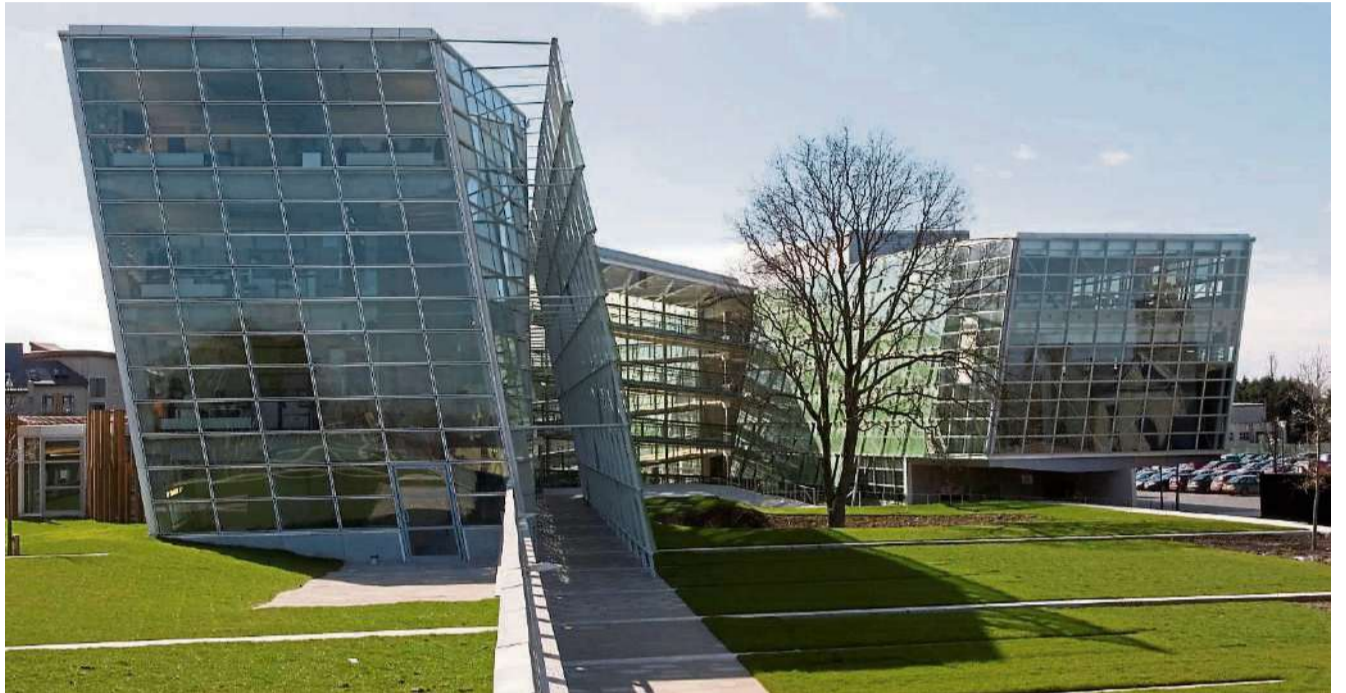
The decision to replace a creche originally included in the planning permission for housing development by Cairn Homes in Naas, and to be replaced with single bed apartments, will be made by An Bórd Pleanála (in February next) rather than by Kildare County Council because it is a strategic housing development. This has been criticised by Naas MD councillors and neighbouring residents

He said it is time to put people at the heart of planning and added that traffic congestion is