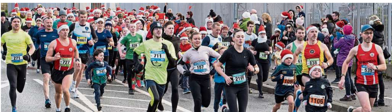
Part of the huge turnout for the Kildare Santa Dash 2019 in Kill, Sunday morning, December 22, supporting Saplings Special School for children with autism and complex needs