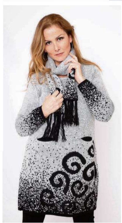
Tunic-style wool dress and matching scarf €65