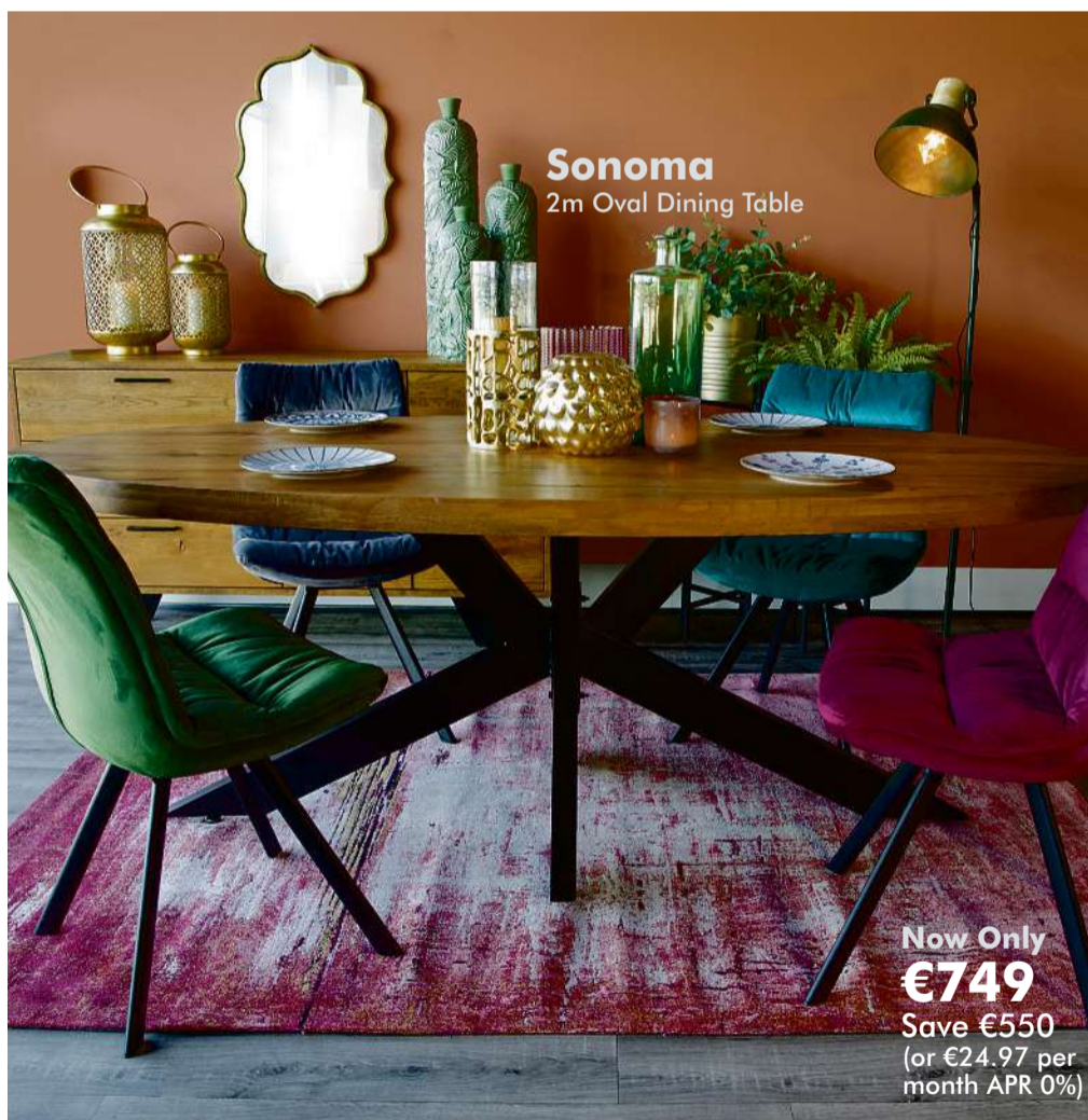
Sonoma 2m Oval Dining Table