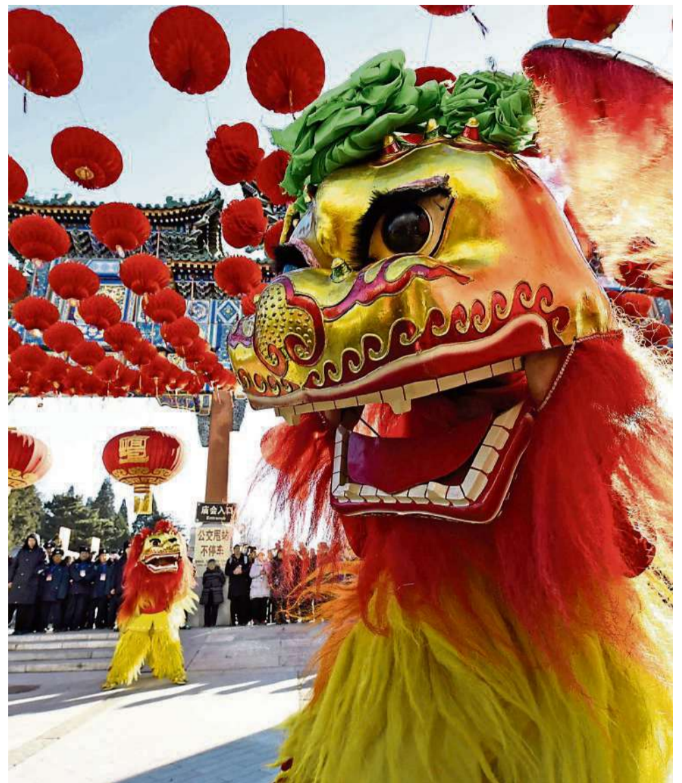
The colourful Chinese New Year celebrations are known globally

settling the previous year's affairs. In order to encourage an auspicious start to the year they also decorate their doors with paper scrolls and gather with relatives for a feast. Following the invention of gunpowder in the 10th century, the Chinese were also the first to ring in the New Year with fireworks.