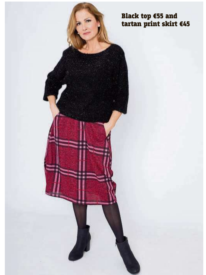
Black top €55 and tartan print skirt €45