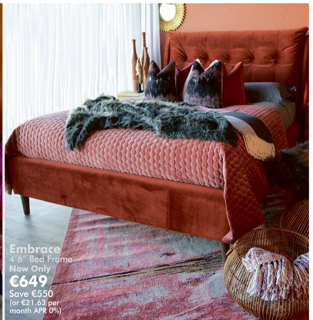
Embrace 4'6" Bed Frame Now Only €649 Save €550 (or €21.63 per month APR 0%)