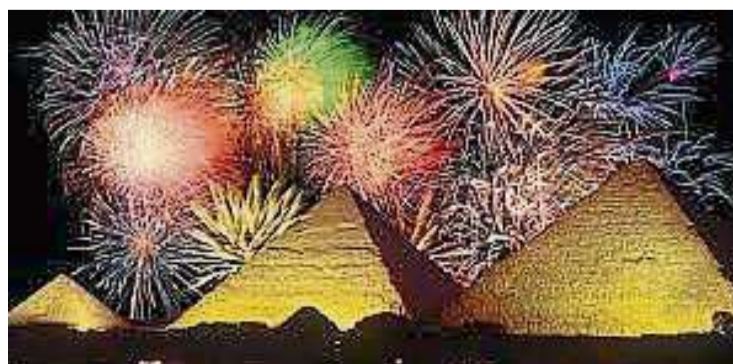
The ancient Egyptians brought in the New Year with a huge festival

Festivities traditionally last 15 days and tend to center on the home and the family. People clean their houses to rid them of bad luck, and some repay old debts as a way of