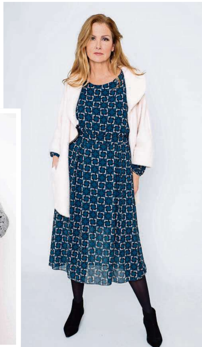
Pink jacket €95 dress €59