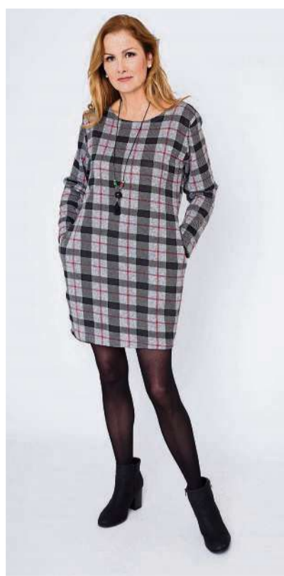
Tunic-style dress €59