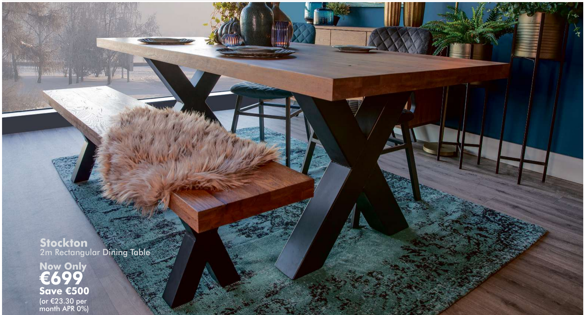
Stockton 2m Rectangular Dining Table Now Only €699 Save €500 (or €23.30 per month APR 0%)