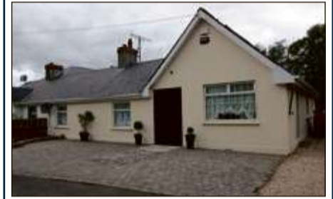
GREEN LANE, KILMEAGUE