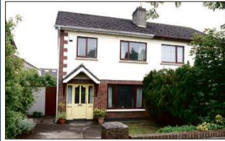
HILLVIEW GREEN, CLANE