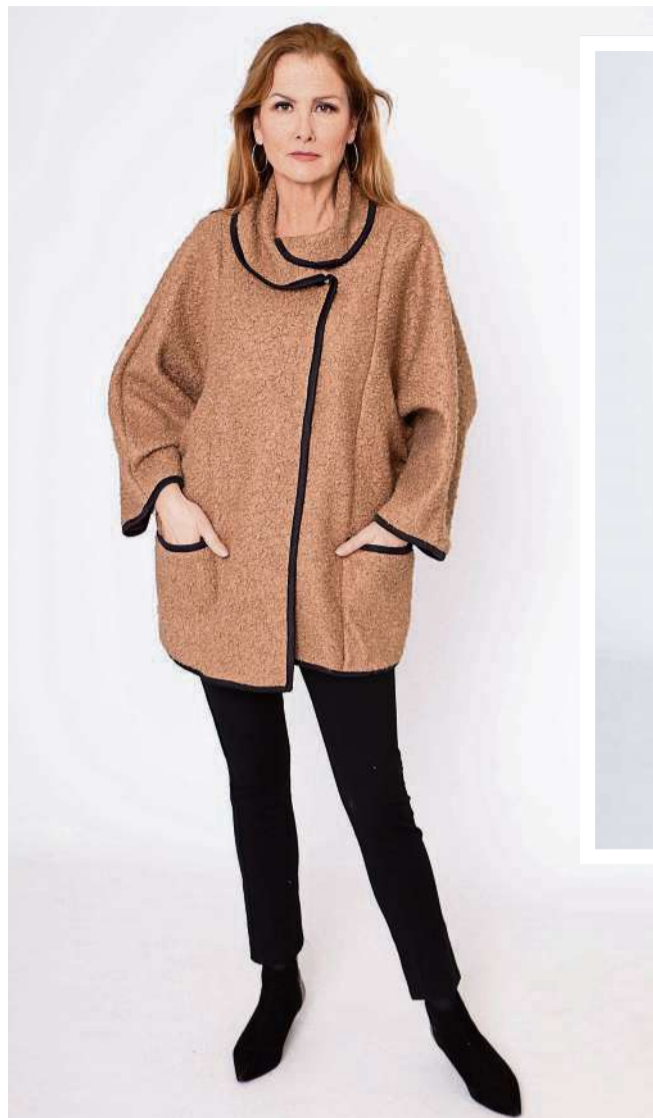
Easy poodle jacket €59 and black leggings €25