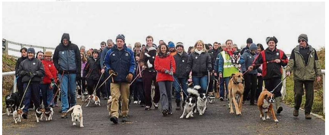
This year's annual Curragh Dog Walk is scheduled for Sunday, December 29 at 12 midday