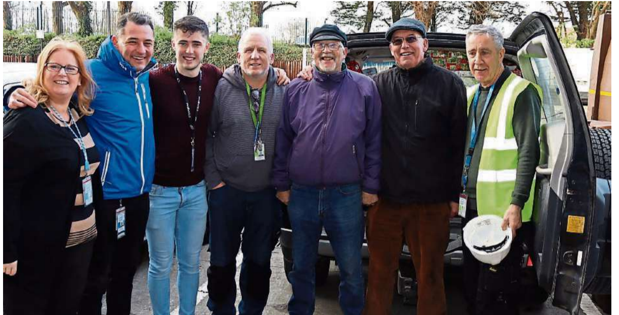
Representatives of St Vincent de Paul in Celbridge with Intel employees

The society focuses on a practical approach to dealing with poverty, alleviating its effects on individuals and families through working primarily in person-to-person contact by a unique system of family visitation and seeking to achieve