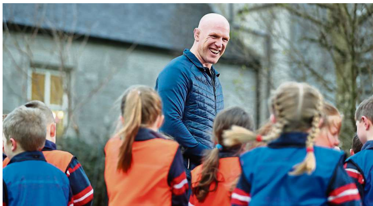
Aldi's new ad 'Feeding the future of Irish rugby' launched this week was launched by rugby legend Paul O'Connell

Visit www.aldi.ie/play-rugby to get your school signed up for free.