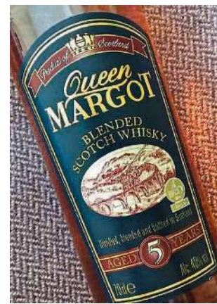
Two bottles of Queen Margot scotch were stolen