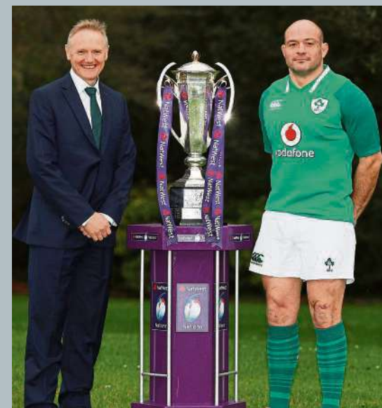
Can Rory and the boys do it in 2018?

WE are edging closer to the Six Nations. Ireland kick off their campaign this weekend against France in Paris. The squad who usually train in Carton House decided to mix things up this year and they travelled to Spain for some Vitamin D and to get set for the challenge ahead. James Cronin was a last minute call up as Dave Kilcoyne suffered a knock against Castres. A total of ten Munster players are in the Irish set up and after the performance against Castres I will be expecting to see a number of Munster players in the starting fifteen. I am heading to London on St Patrick's