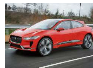
Artist rendering of the Jaguar Land Rover Software Engineering Centre when it is completed. Pictured above is the fully electric I-Pace