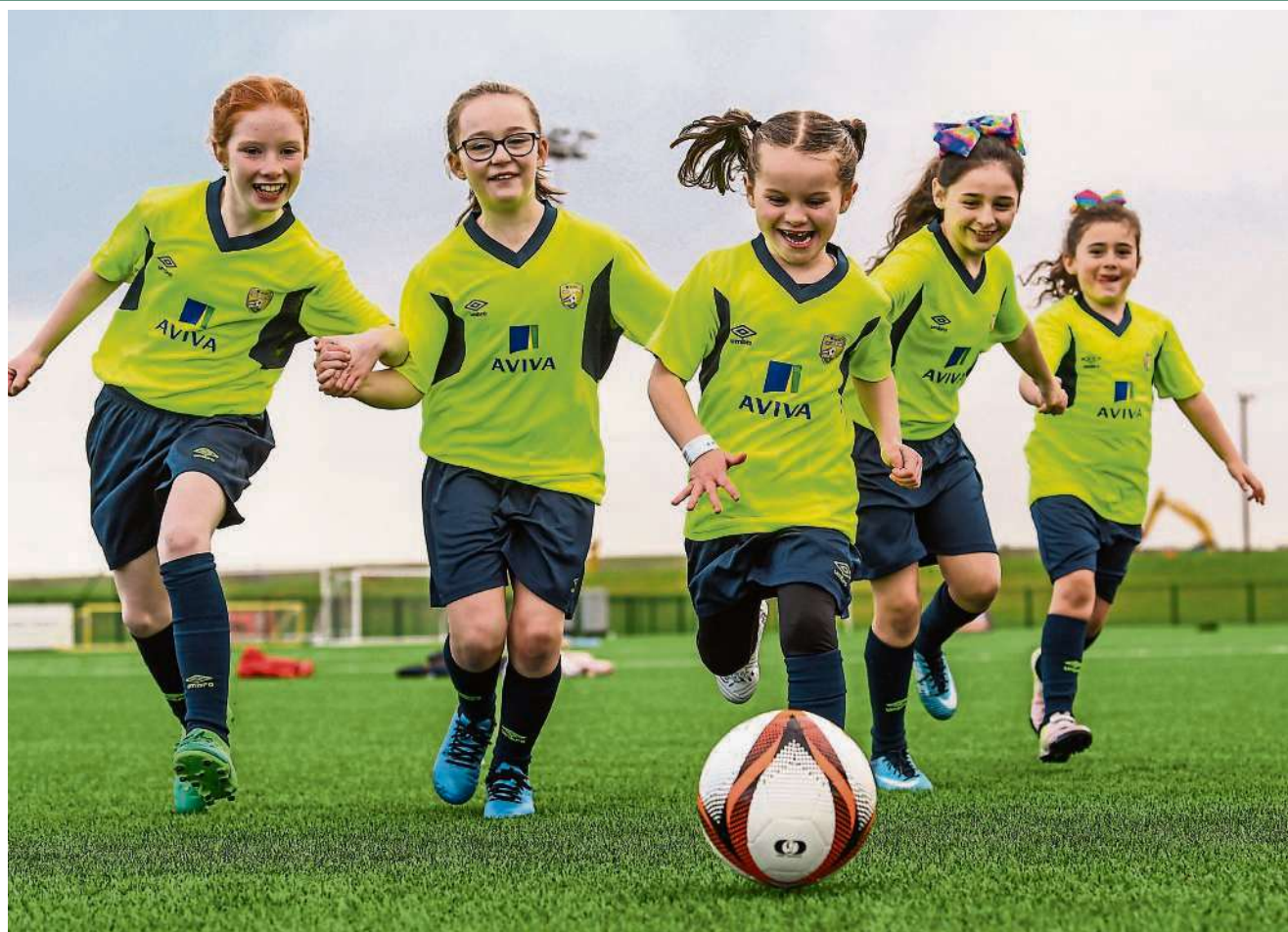
The Aviva Soccer Sisters initiative returns to Limerick this Easter in association with the FAI. For more, see the notes below