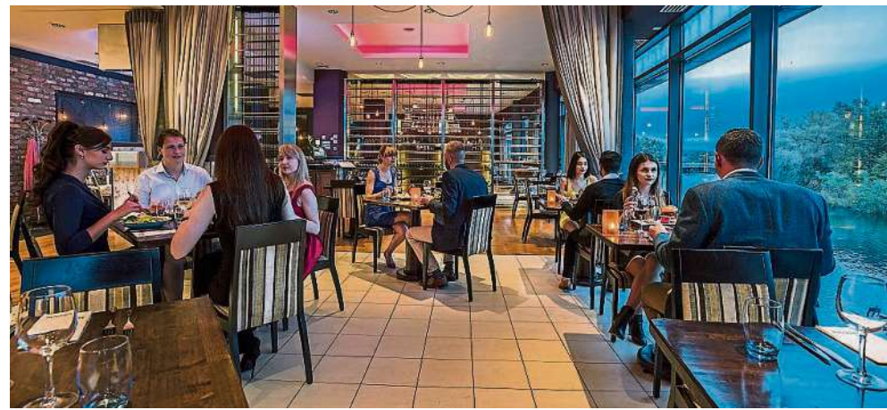
Book your dinner date at the Absolute Hotel Restaurant now

To book call +353 61 463600 or visit www.absolutehotel.com