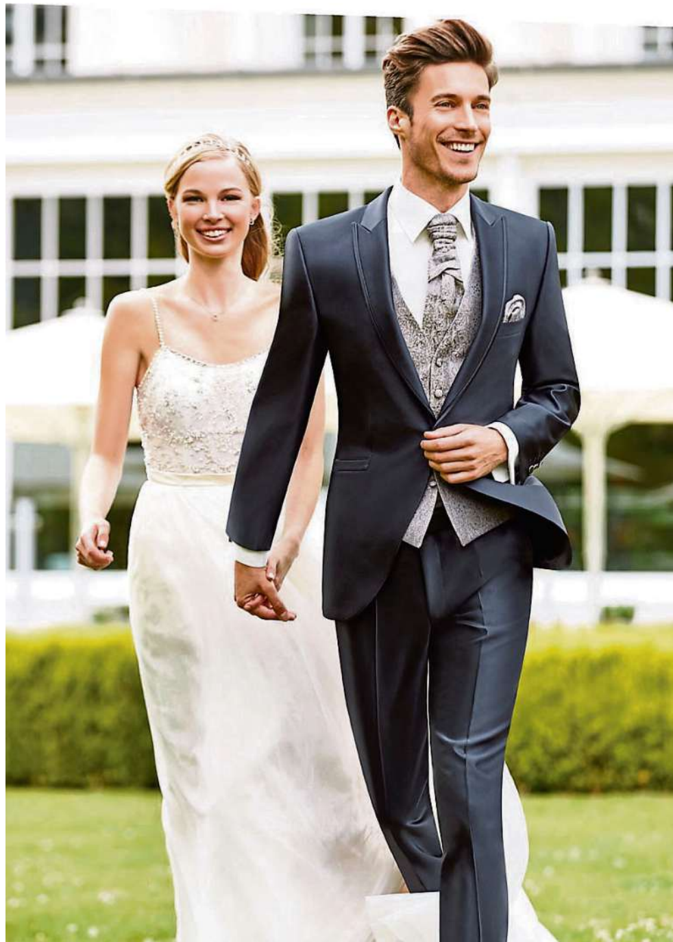
Looking you best on the big day: There a number of menswear shops in Limerick so browse around

A bit of a traditionalist? Then chances are you've already decided on a classic morning suit (a tailcoat, a dress shirt either with a turndown or wing collar that is single- or double-cuffed, a waistcoat, and a pair of formal trousers), but you're probably still weighing up whether to buy or hire. If money's no object, then you're likely not all that fussed on whether you'll get an opportunity to wear your wedding suit post-nuptials, but if, on the other hand, you'd rather only splurge on something you'll get decent mileage from, look for a