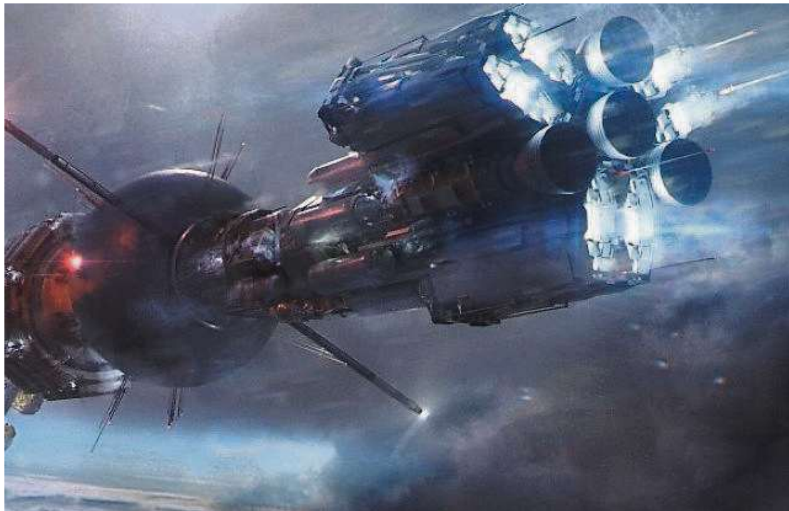
Concept art for the Nightflyer ship from the series of the same name which is shooting at Troy Studios. Hundreds of extras are required for filming

"We are trying to keep the extras casting as diverse as possible so we really are welcoming people of all ages, nationalities and genders. No experience is necessary so for people who never