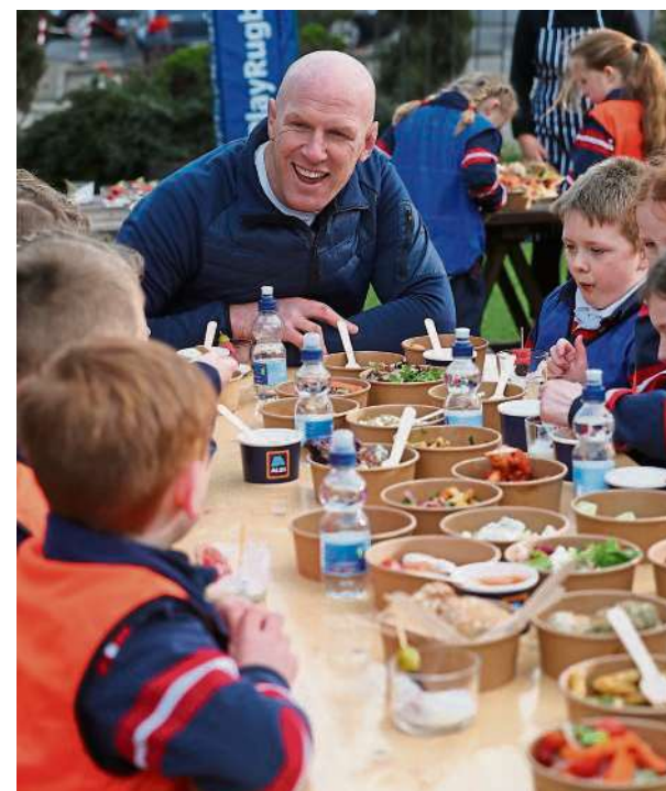
The rugby star then joined students for a healthy snack