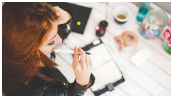
The adrenal glands are small glands located on top of each kidney. They produce hormones that you can't live without

These little glands sitting on top of our kidneys are essential to keep us alert and help us deal with stress. They release the 'stress' hormones, adrenalin, noradrenalin, cortisol and DHEA. While the