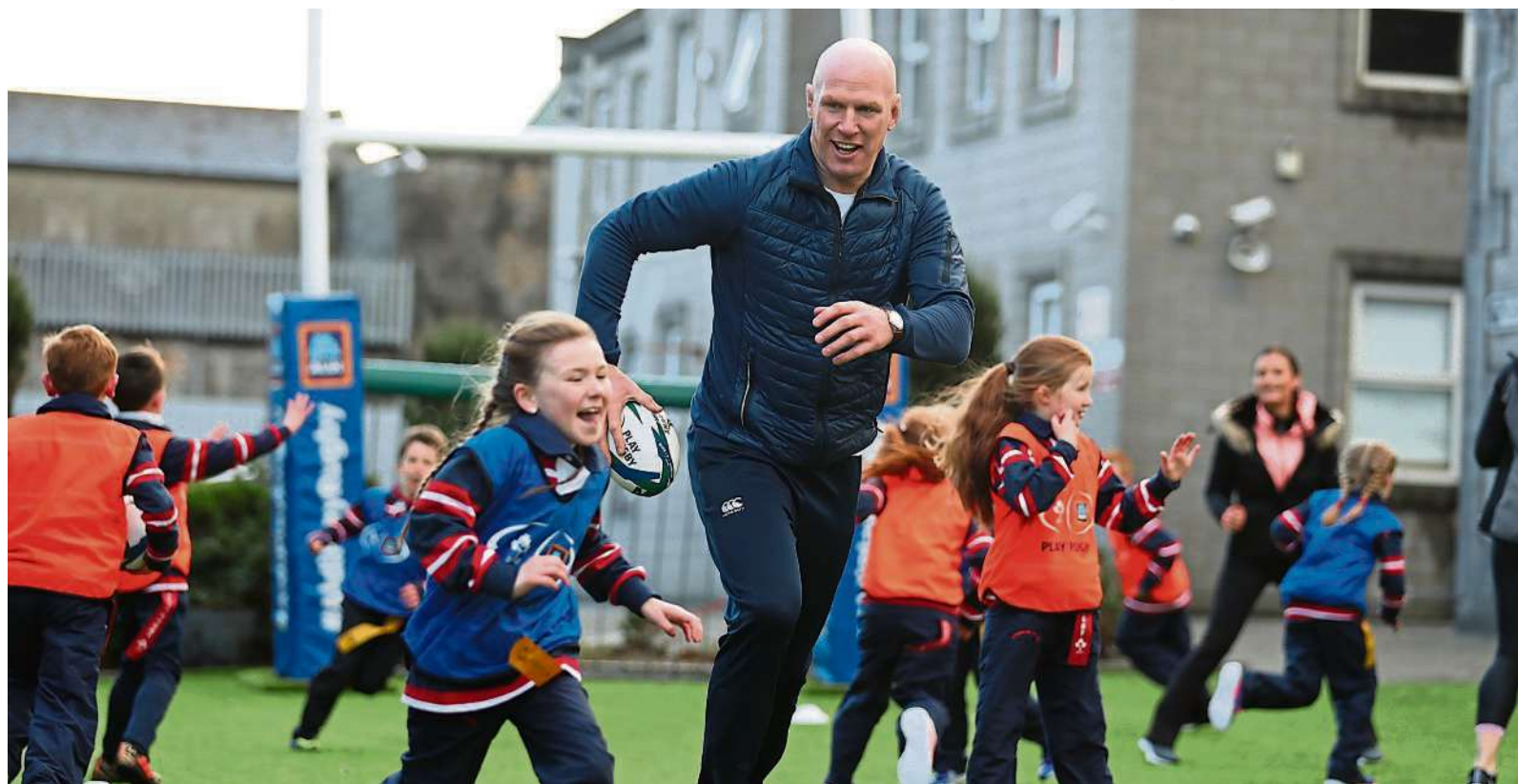
Paul O'Connell returns to his primary school, An Mhodscoil, to surprise students while promoting Aldi's new campaign – the Aldi Play Rugby programme

gramme is free to join and my old school was actually the 1,100th member to sign up," he added.