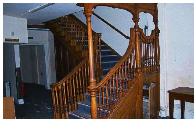
Cotswold District Council is donating the Bannatyne staircase to Limerick Civic Trust after the demolition of a local hospital

Plans are in place to turn St Munchin's Church into a military museum.