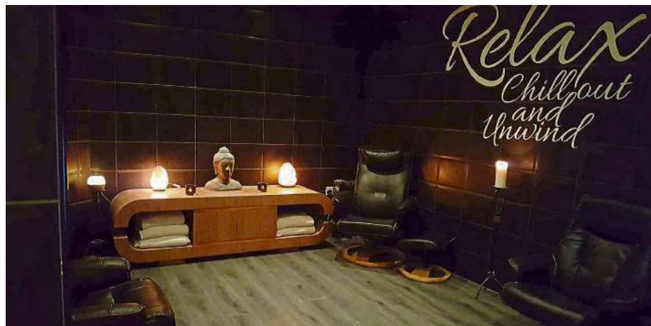
Ultimate Health Clinic at Georges Quay

SEE THE EXPERTS DIGESTIVE DISORDER SORTED