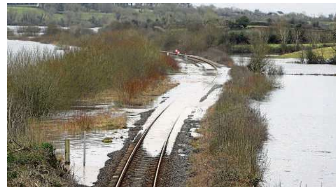
Ballycar, in Clare, pictured in 2014, has been affected by 'significant flood events' in recent years, according to Irish Rail

Met Eireann issued a notice for freezing temperatures on Monday night.