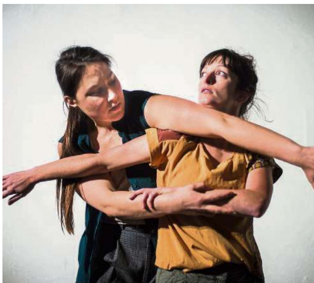
What Next: Oscillate is one of the works for the new dance festival