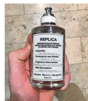
Martin Margiela fragrances; At The Barbers, created by

MY fragrance of the week is Replica, At The Barbers by Maison Margiela. You may have seen my previous Maison Margiela fragrance review of Jazz Club, which gave background to the brand (see my instagram @iammcloughney for details) so I'm going to spare you a history lesson on this occasion and just give you the low down on another of the ever popular Maison