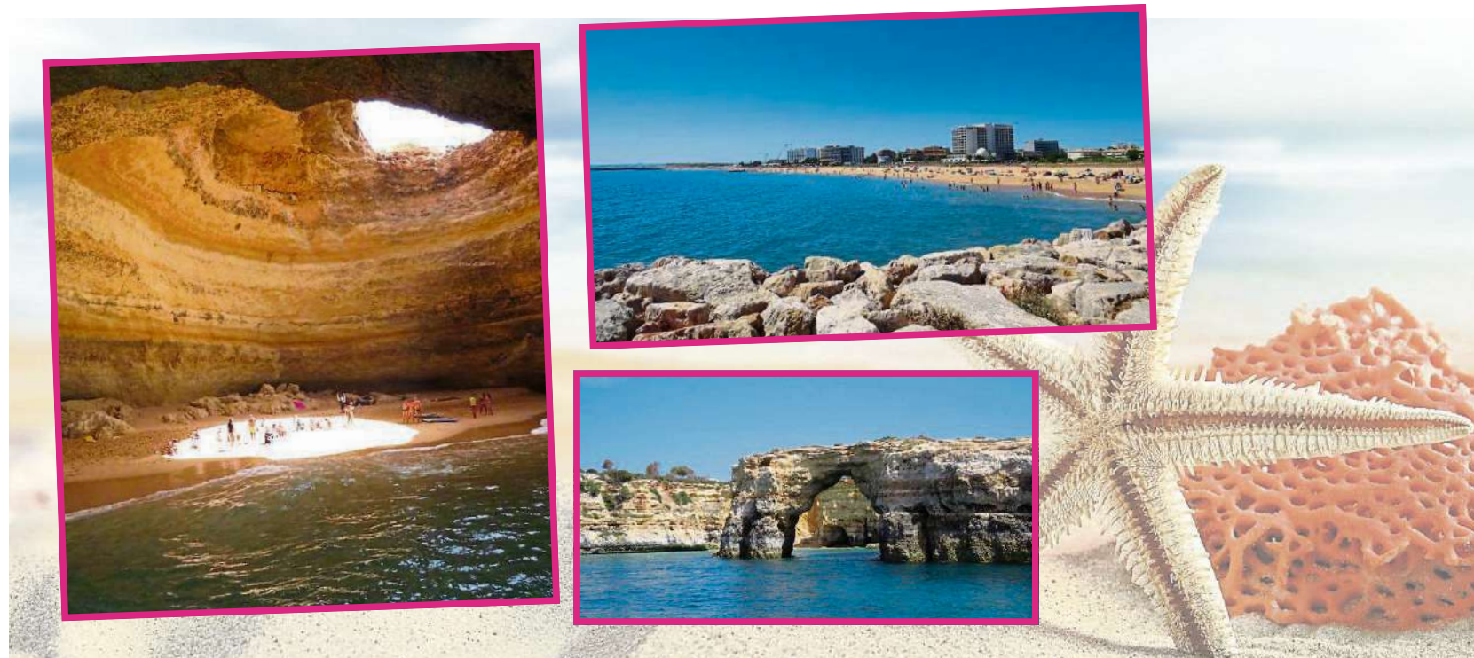
Summer memories: A few of my holiday snaps from last year in Portugal

Portugal is a new tag rugby festival taking place on the beach in Portugal and it's happening this May. Once I heard about it I didn't hesitate to sign up. I don't even have a