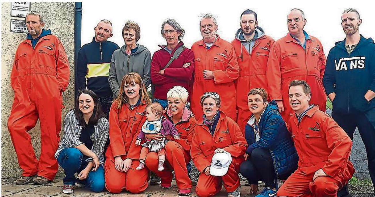
Some of those who took part in Jump in July for South Tipperary Hospice Movement at Tandem Skydive in County Longford