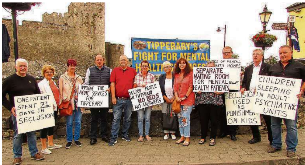
A group gathered in Cahir to highlight issues concerning the lack of beds and services for mental health patients