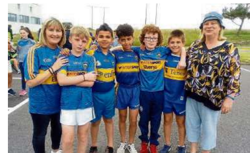
Ss Peter and Paul's under 12 skittles team were narrowly beaten by Clare