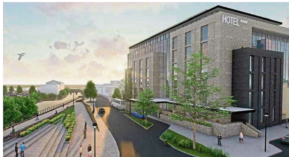
An artist's impression of the proposed new hotel on the site of the former Clonmel Arms Hotel

McGrath says the development must not be subjected to further delays. "This is excellent news for Clonmel and the broader regeneration of