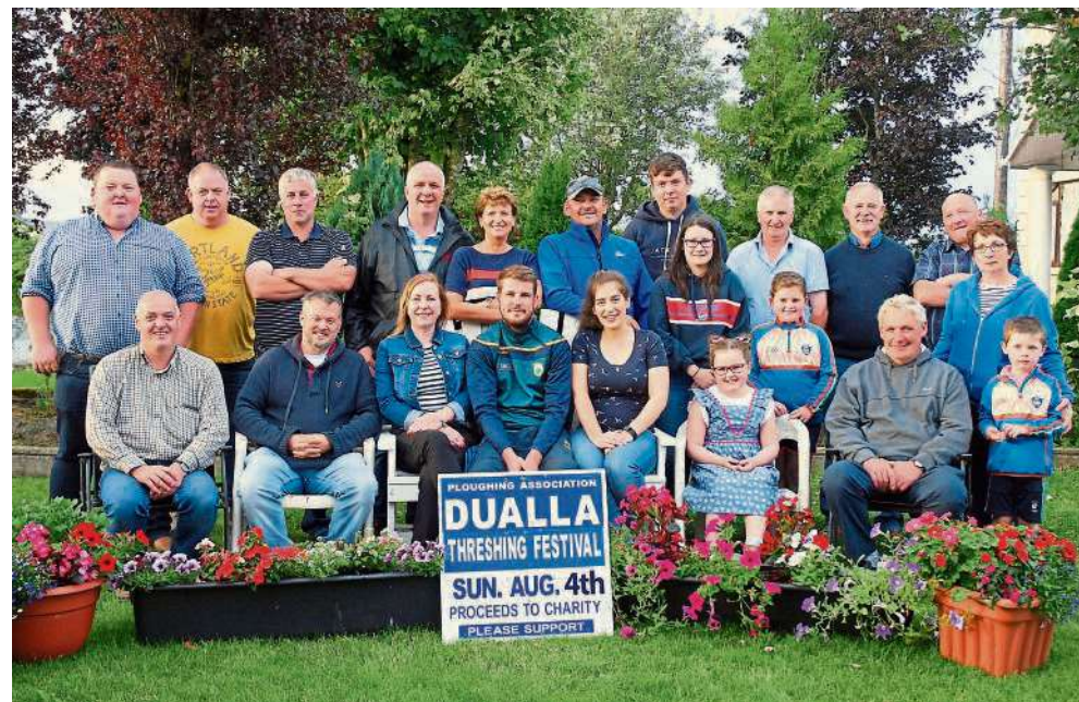
Pictured is the Dualla Threshing Festival committee ahead of the Festival and Charity Horse Show on Sunday

Classes are as follows: Puppy class (up to 12 months old) Golden Oldie (7+ years) Small Dog Medium Dog Large Dog Best Rescue Dog Best Groomed Dog