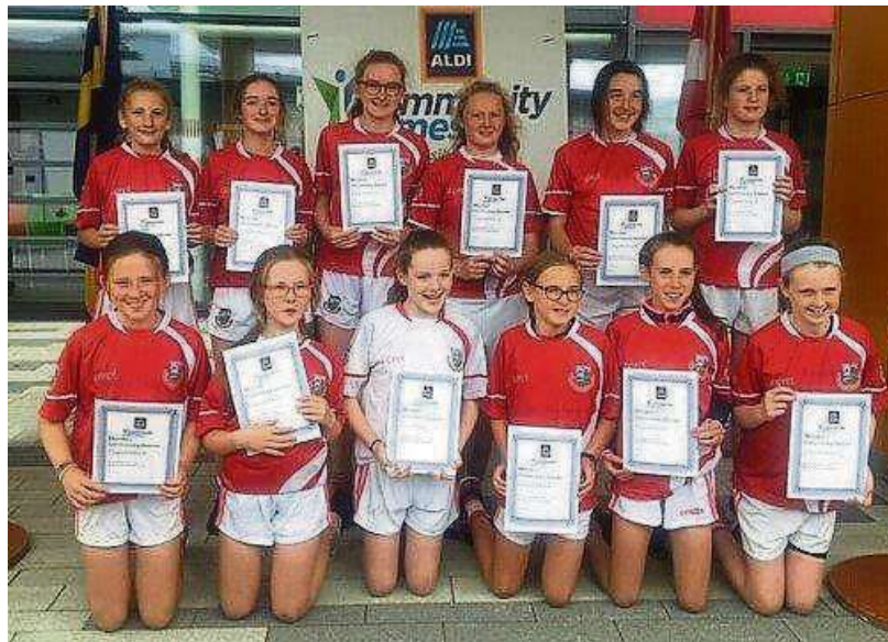
Bansha girls under 14 football team receiving Munster

Futsal boys u15: Newport were beaten by Kerry in the futsal boys u15 and girls u15 semi-finals, and also in the girls u12.