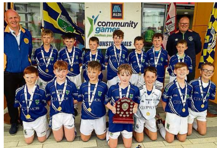
Fethard-Killusty beat Limerick in the semi-final and Kerry in the final