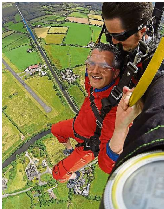
Mayor of Clonmel Garret Ahearn enjoying the experience