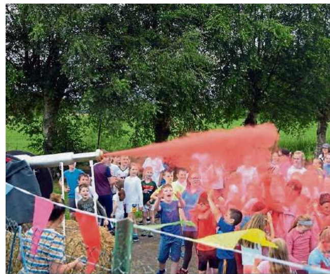
The colour cannon blasting off Holi Powder before the mayhem of the obstacles course