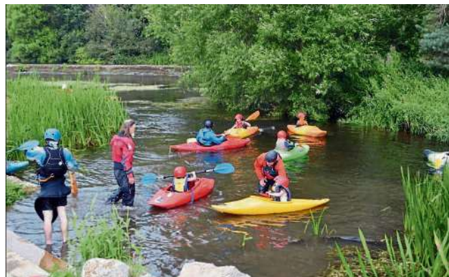
Canoe spins on the river Suir with Ardfinnan Canoe Club