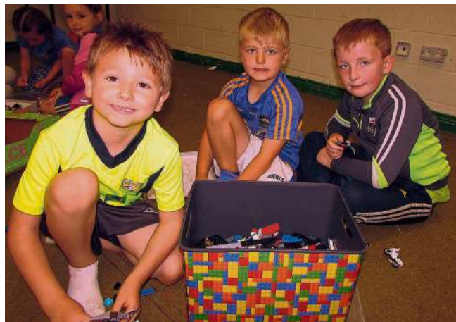
Some of the future football stars enjoying summer camp in Cahir

Last Saturday was the day for the small ball! While Croke Park was the venue for the All Ireland Hurling Semi-Final, Tallow, Co. Waterford