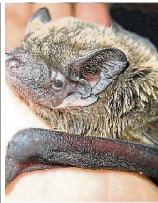
A Leislers Bat

The long grass is also a safe home for rabbits, and this year their population, appears to be strong. We saw several out feeding, and they quickly scurried in a field gate, as we passed by. Foxes will scavenge for road kill, and I have also seen several buz-