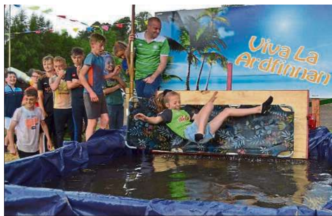
Kids waiting to be dunked into the dunk tank