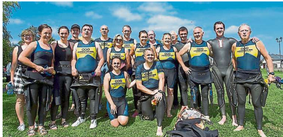
Carrick-on-Suir Triathlon Club members before taking part in the Barry McCarthy Memorial Swim