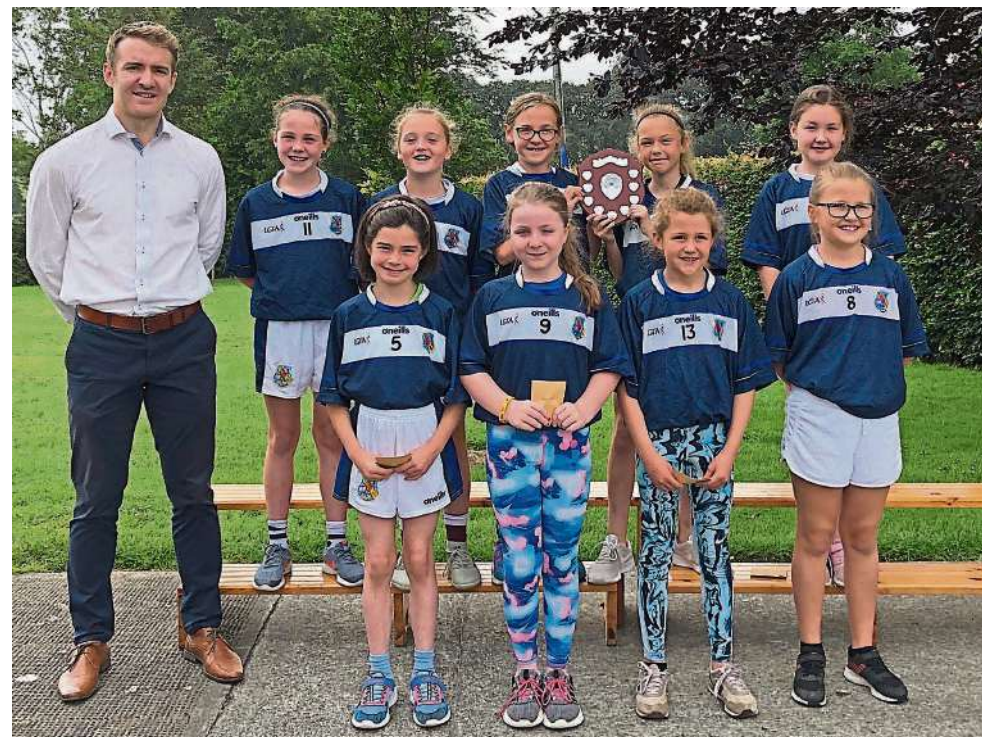
Tipperary hurler Noel McGrath visited Thomastown N.S. recently to present the under 11 ladies football team with their County Cumann na mBunscol medals